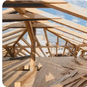
3. Structural works, masonry, framework