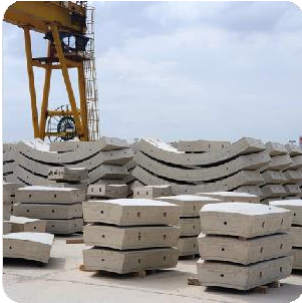
1. Primary construction materials