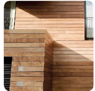
8. Door and drawer fronts