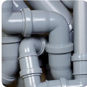
2. Roadways, various networks