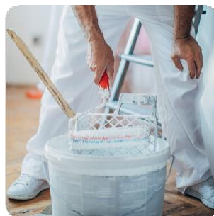
11. Paint, maintenance products, glues and treatments*