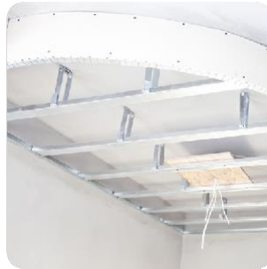
7. Partitioning, Ceilings